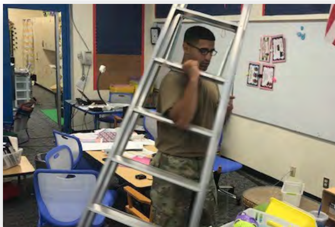
Assisting a local school prepare for the new school year, Aug. 20.