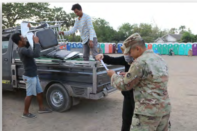
A Soldier works with a contractor during exercise Garuda Shield 19 .