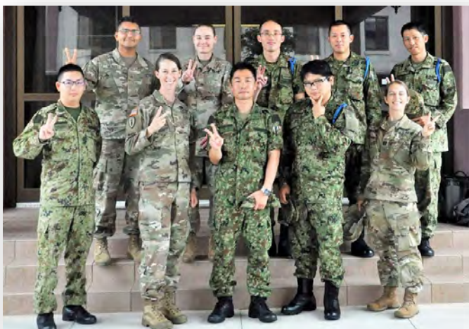
JGSDF members visit their US Army counterparts, Aug. 19.