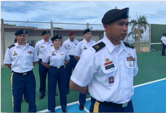
Soldiers stand in formation for an in-ranks inspection during payday activities, July 3.