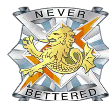
Kin No Ashika