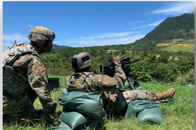
A Soldier coaches another during a M19 firing range, July 16.