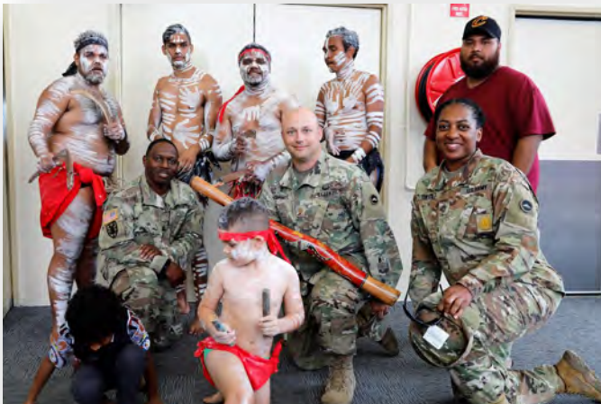
Soldiers pause for a photo with local dancers during exercise Talisman Saber 2019 in Australia.