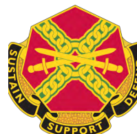
1st Battalion 1st Air Defense Artillery Regiment