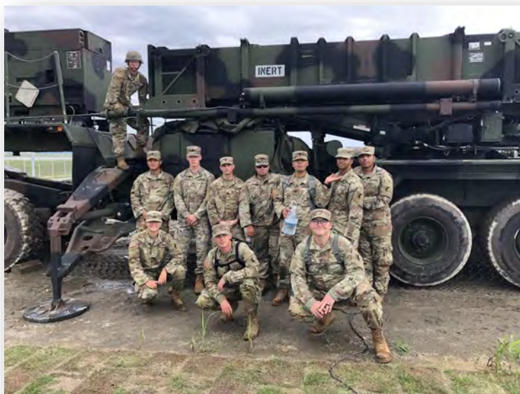
Crew 1 from Charlie Battery poses in front of a fully operational M903 Launching Station.

day venture on the USNS Brunswick. Upon arrival, Soldiers download, stage, and emplace the Battalion's Patriot equipment in a strong, defensive posture.