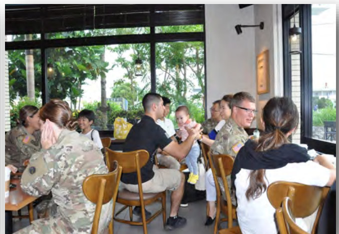
English conversation program, Aug. 14.