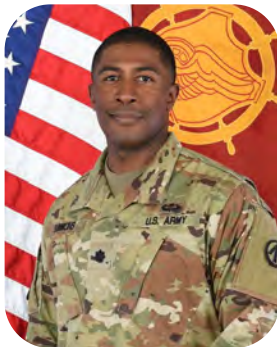
Commander, 835th Transportation Battalion