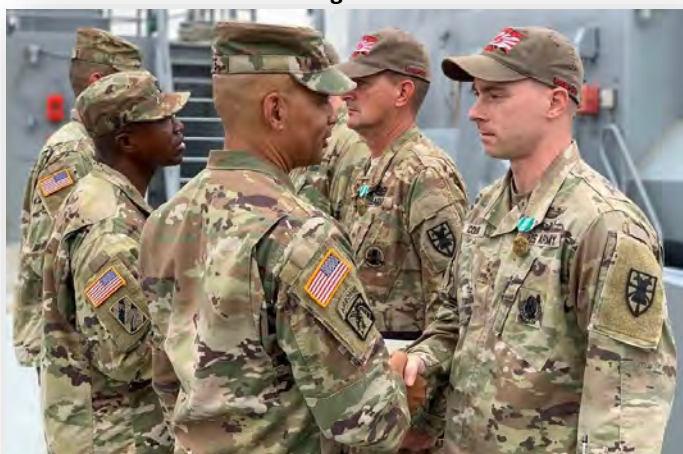
Crew of LCU 1212/22 receives EOT awards, Sept. 3.