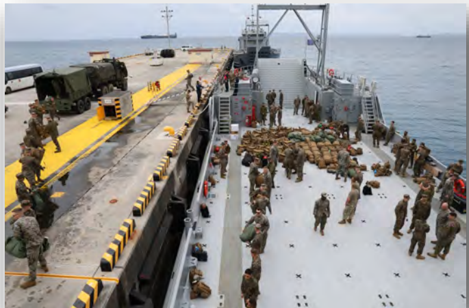
Crew of LCU 2010 transports U.S. Forces and equipment to USNS Pililau, March 18.