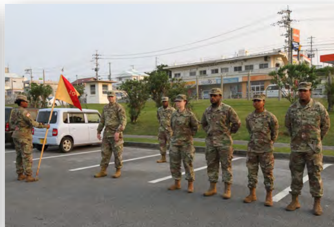
Soldiers stand ready to receive awards for outstanding performance, March 28, on Torii Station.