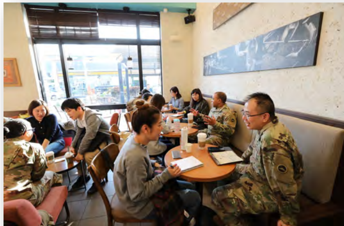
Local nationals and Soldiers participate in the English conversation program, March 13, near Torii Station.