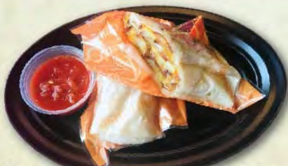
Breakfast Sausage or Bacon Burrito with Salsa

And now serving breakfast options for $4.50 each