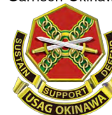
Army's Home on Okinawa