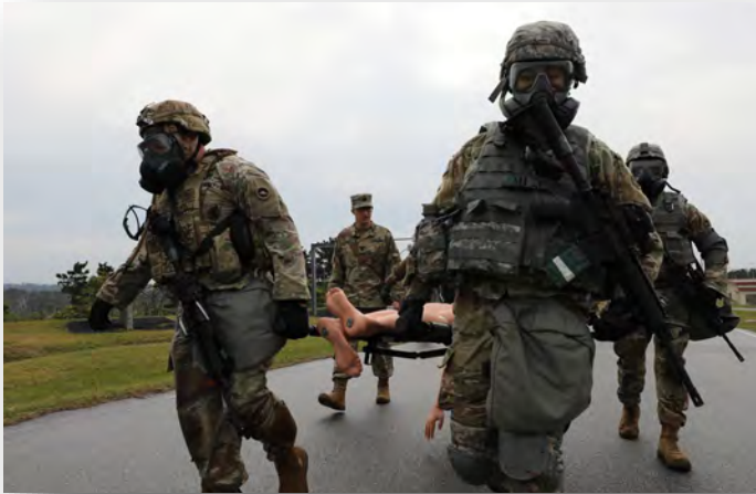
Soldiers train in austere conditions, March 8, on Camp Hansen.