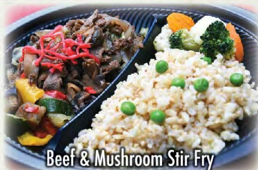
Beef & Mushroom Stir Fry