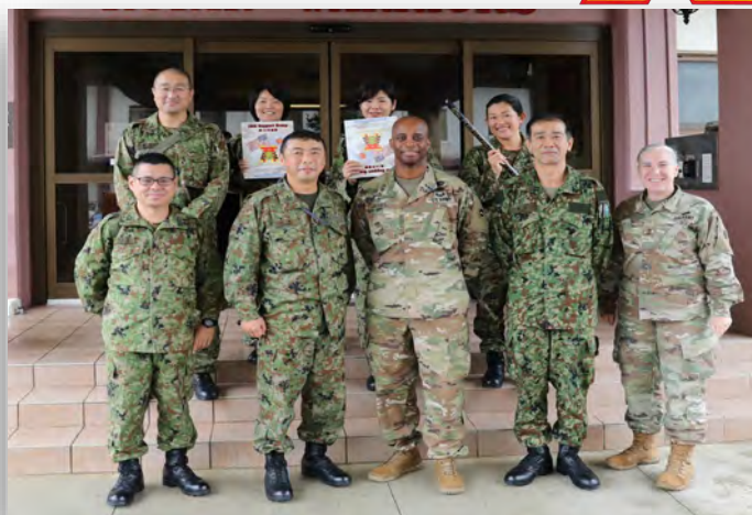
15th BDE PAOs visit Torii Station for Bilateral training, Feb. 13.