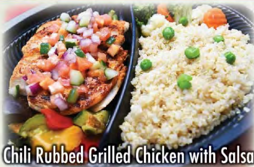
Chili Rubbed Grilled Chicken with Salsa

Try our lunch or dinner options for $8.50 each