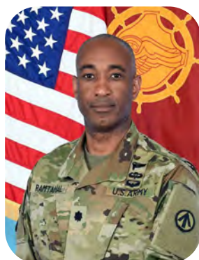
Commander, 835th Transportation Battalion Lt. Col. Eldred Ramtahal