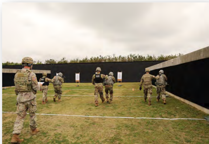
Soldiers train at the ARM range, Feb. 7, on Camp Hansen.