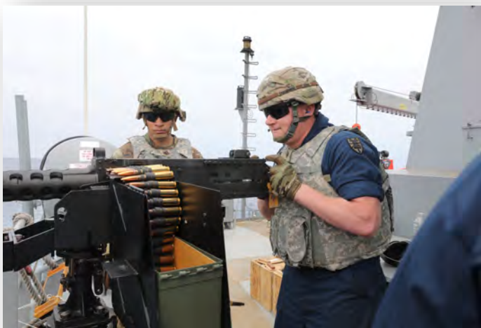
A Soldier prepares to fire the M2 .50 Cal. weapon, Feb. 20.