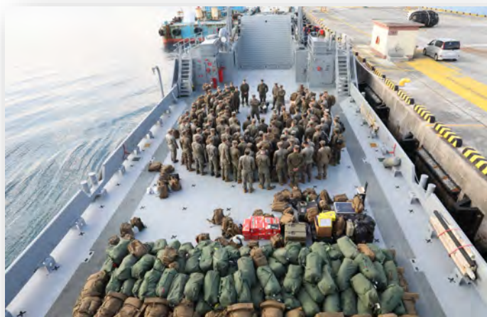
LCU 2010 and its crew prepare to support Marines , Jan 25.