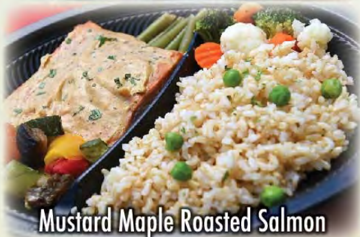
Mustard Maple Roasted Salmon