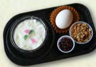
Bulgarian Yogurt with Cranberries and Granola Served with Hard Boiled Egg