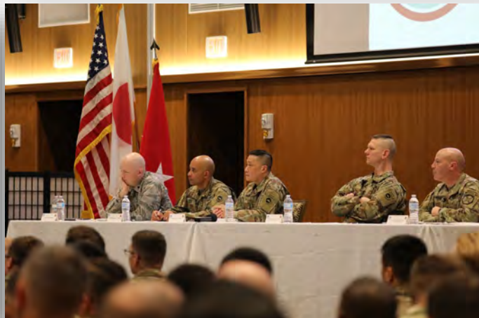
A panel of leaders listen to housing concerns at a town hall meeting , Feb. 28.