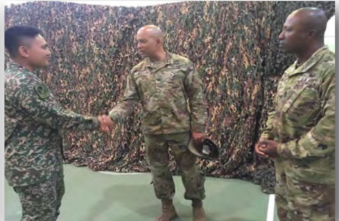
The Command Team engages with a Malaysian Soldier at Exercise Keris Strike, March 11.