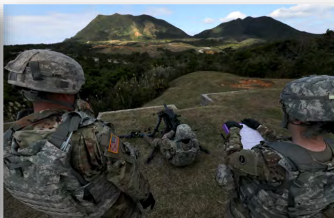
Soldiers participate in a Mk 19 grenade launcher range on Camp Schwab, Jan. 28.