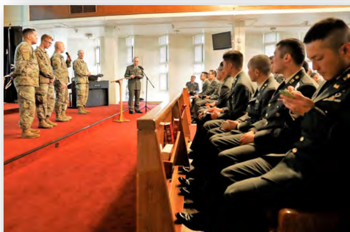
Soldiers speak with JGSDF Officer Candidates, Feb. 28.