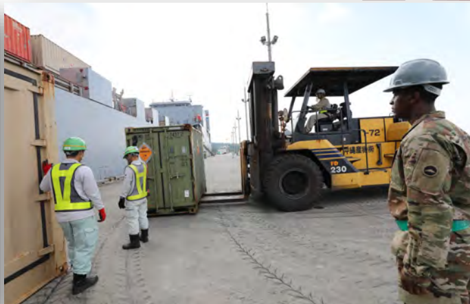
MLCs and a Soldier work together to move containers onto a LCU boat, Jan. 15.