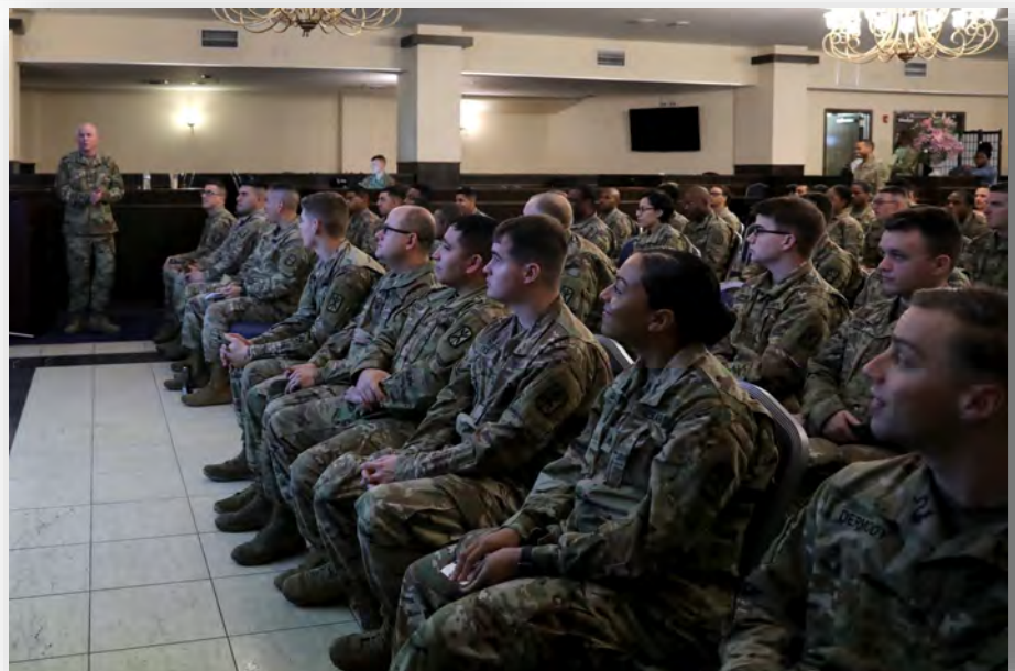
Soldiers listen attentively to a brief by senior advisors of the Signal Corps.