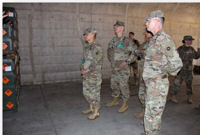
Maj. Gen. Luong (left), Commanding General, USARJ, inspects ammunition in an earth covered magazine at Kawakami Ammunition Depot.

The Ammunition Depot Okinawa completed the U.S. Army Corps of Engineers' (USACE) assessment of the facilities in the Munitions Storage (MUNS) area. The outcome from the USACE FY19 deficiency condition assessment of 60 magazines, two operating buildings and 10 open storage cells will be analyzed and developed into a Project Programming report which identifies primary deficiencies, recommendations of repair and replacement, summary of findings, and Rough Order Magnitude (ROM) costs for repair and replacement. The assessment directly supports USARJ's setting the Theater Line of Effort (LOE). The Ammunition Depot Okinawa, containerized and loaded nine containers in support of Exercise Cobra Gold 19. A total of $585,172 of Class V supplies for Cobra Gold and Balikatan 19 were loading onto a LCU vessel headed to Subic Bay Port.