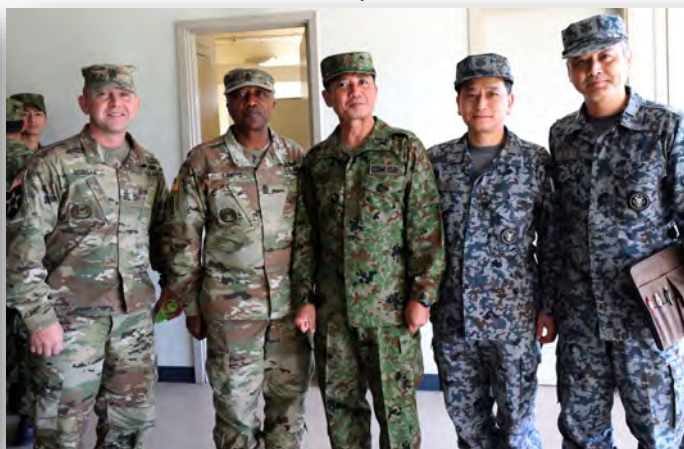
Senior Enlisted leaders from the U.S. and Japan militaries pose for a photo, Jan. 18, at Camp Naha.