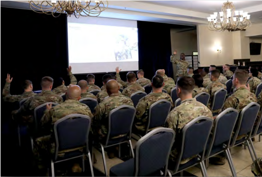
Soldiers participate in the discussion.

Signal Corps Senior Career advisors from the U.S. Army Human Resources Command visited Okinawa, Japan to provide professional career insight, assistance and guidance to Signal Soldiers on Feb. 11. Advisors updated Signal Soldiers on the state of the Corps, its direction and then met with the Soldiers one on one to help them identify, refine and achieve their professional and personal goals.