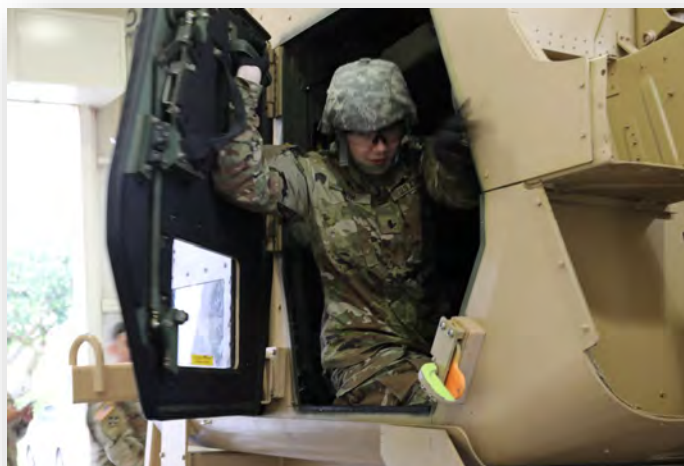
A Soldier exits a simulated rollover vehicle, March 21.