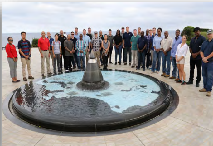
Soldiers pose for a photo on a staff ride, Feb. 21.